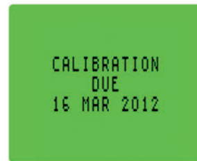
Configurable calibration options