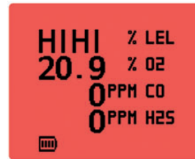
Red display in alarm conditions