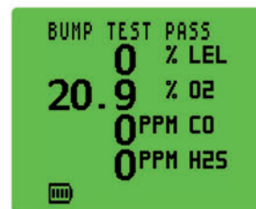
Configurable bump options